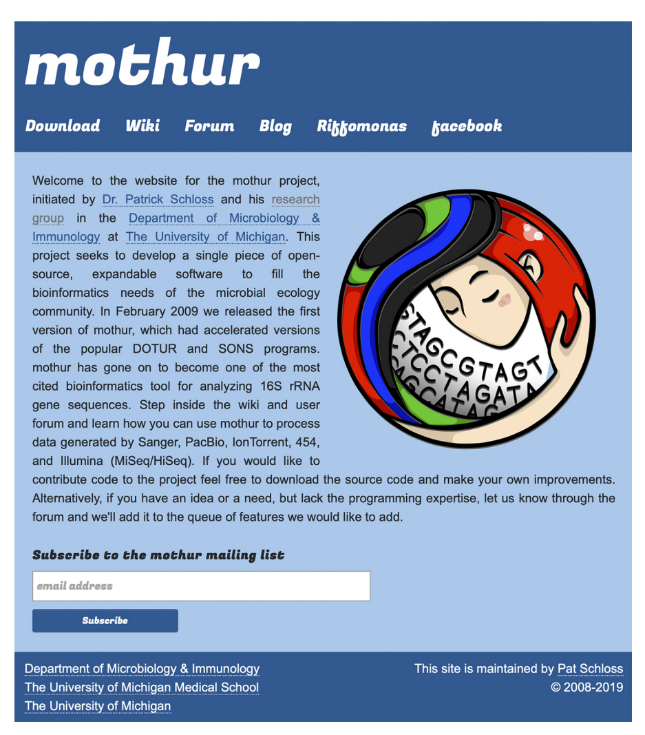
FIG 2 mothur homepage. From the mothur home page at www.mothur.org, users can download mothur, access a user forum, navigate a wiki with extensive documentation, find blog posts that provide additional examples of how to use mothur, join the mothur Facebook group, and subscribe to the mothur mailing list.

and ARB/SILVA's aligners were not open source or publicly available. Thus, we realized that such an important functionality needed to be open to the community (43). More recently, the rejection of closed-source, commercial tools can be seen by the broader adoption of open-source alternatives. This has been the case with the rising popularity of VSEARCH over USEARCH within the microbial ecology community (55, 56).